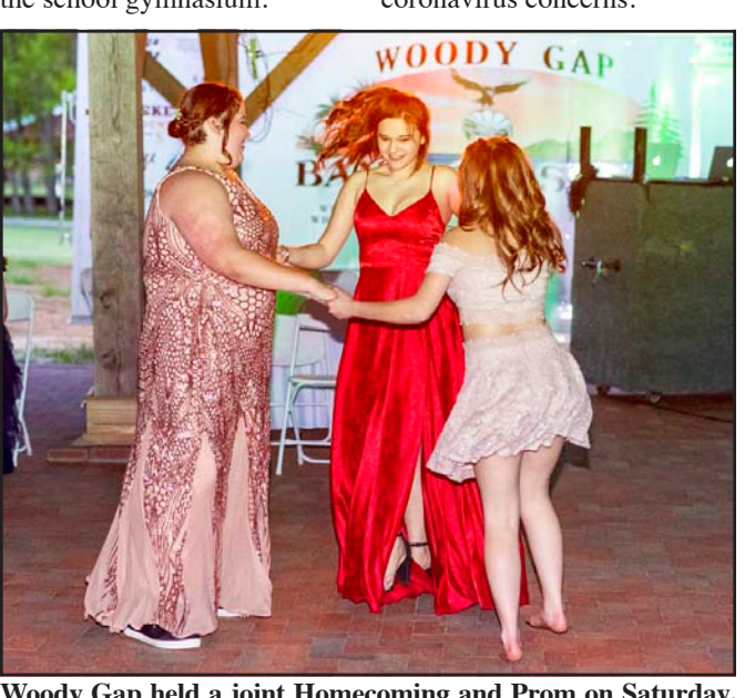
Woody Gap held a joint Homecoming and Prom on Saturday, May 8, where students dressed to the nines and got a little foot- loose on the dance floor.

The school also expects address announcer during the to be the site of the annual July 4 fireworks celebration and October's Indian Summer Woody Gap are scheduled for Festival. Both events were Saturday, May 22, at 10 a.m. in scratched in 2020 due to coronavirus concerns.